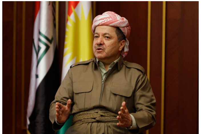
LEADER: Kurdish Regional Government President Masoud Barzani during an interview with Reuters soon after signing the deal with Exxon in 2011.

The first meeting was in Arbil, which is dominated by a central citadel that is one of the oldest continuously