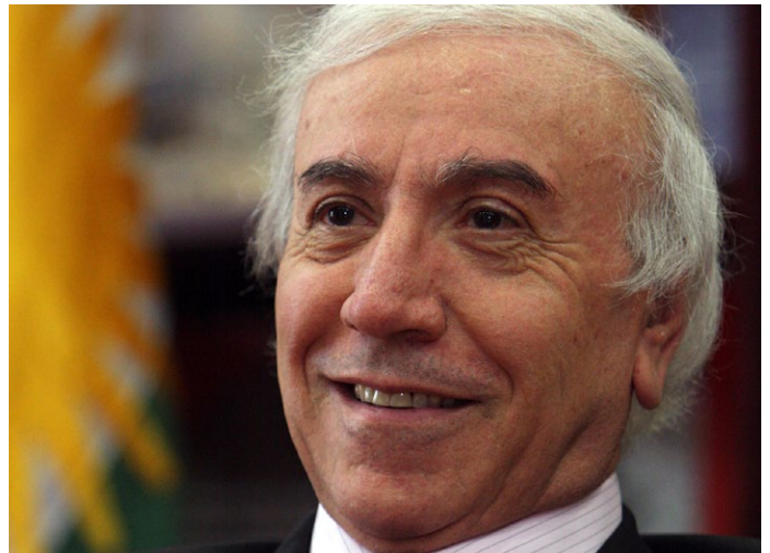
POINT MAN: Ashti Hawrami, Iraqi Kurdistan's Oil and Gas Minister, during a 2010 interview with Reuters in Arbil. Hawrami has likened the Exxon deal to working with "the giant and magnificent".

The six blocks Exxon won were scattered around the autonomous region. One block was near Turkey and another near the border with Iran. The three most controversial were along the line that divides Kurdistan and