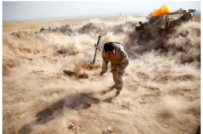
BLAST: This year's offensive by militant group Islamic State threatened Arbil but also reminded Washington and Baghdad of the importance of Iraqi Kurdistan. Here, a Kurdish Peshmerga fighter fires mortar shells towards Zummar, near Mosul, in September.

"What really binds Kurdistan to Baghdad is money," said Robert Ford, who retired from his post as U.S. ambassador to Syria in February and previously served three stints for the State Department in Iraq. "The more the Kurds have an independent source of income, especially from energy, the more it feeds into their desire to establish greater autonomy if not independence from Baghdad."