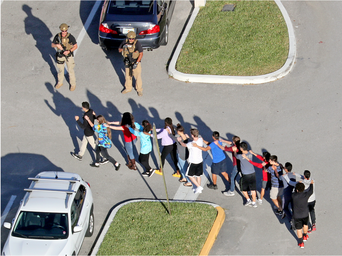
Hands raised, students are evacuated from the school by police. Officers from multiple agencies and SWAT team members responded to reports of an active shooter on campus about 2:40 p.m.