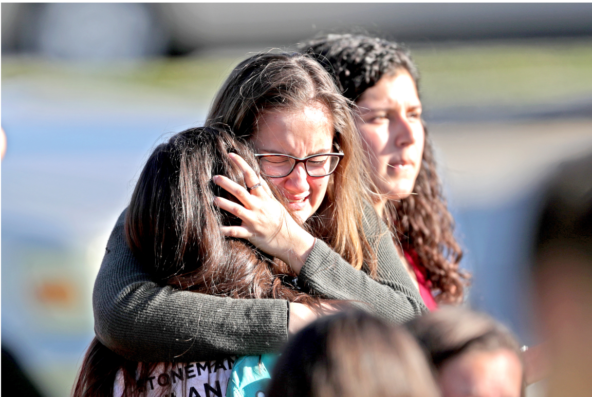
Students are released from a lockdown Wednesday outside Marjory Stoneman Douglas High School in Parkland. Victims included students and adults, with 12 shot dead inside the school, two outside, one in the street, and two dying at the hospital.