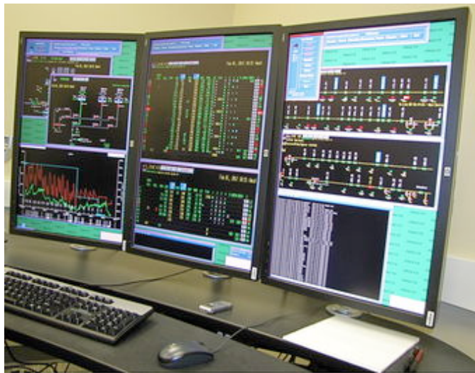
A console in the Enbridge oil control room. The screens show simulations of typical operations for pipelines 6A and 6B.

For years, TransCanada, the Canadian company that wants to build the Keystone XL pipeline, has assured the project's opponents that the line will be equipped with sensors that can quickly detect oil spills.