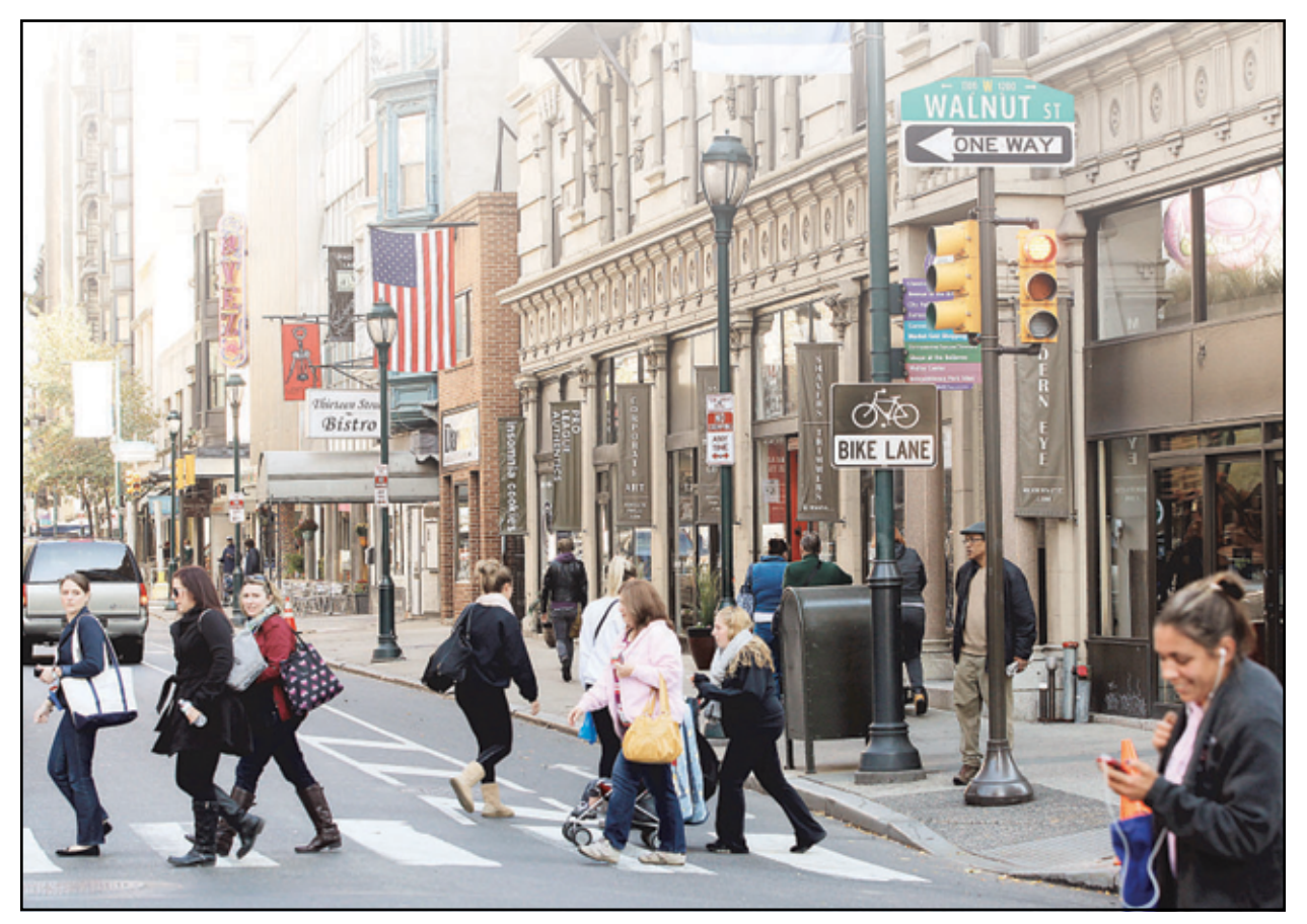
The city now has multiple entertainment areas, including the restaurant row on 13th Street.

Without a doubt, South Broad has come a long way from its pre-Avenue-of-the-Arts days when office