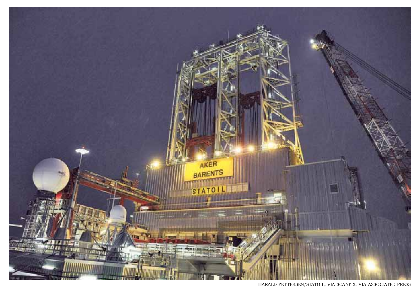
FOCUS ON THE U.S. A drilling rig in the Barents Sea in 2012. Norway, which as a top oil producer has an interest in United States policy, has committed at least $24 million to Washington think tanks in recent years.

In a March 2013 report, scholars from the center urged the Obama administration to increase its military presence in the Arctic Circle, to protect energy exploration efforts there and to increase the passage of cargo ships through the region — the exact moves Norway has been advocating.