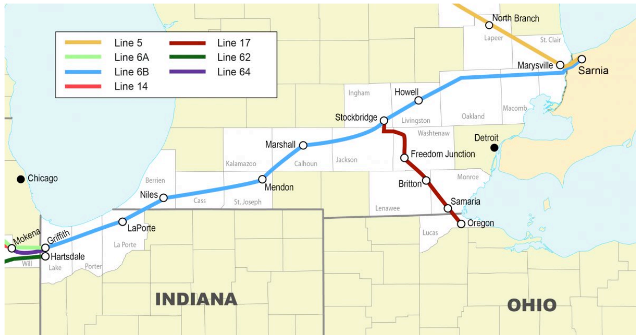
A map of pipeline 6B, in blue

The federal agency responsible for regulating interstate pipelines is the Pipeline and Hazardous Materials Safety Administration [10] (PHMSA), a perennially underfunded and understaffed division [11] of the U.S. Department of Transportation. For the most part the agency relies on pipeline operators to monitor their pipelines and self-report any problems. One of the biggest concerns is corrosion, which can lead to spills or leaks if the corroded areas aren't patched or replaced.