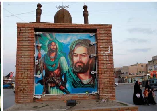
DAILY LIFE: (Clockwise from above left) An outdoor cafe in Sadr City, a Shi'ite neighbourhood in Baghdad, in April; Men play snooker in Sadr City; Shi'ite women walk past a religious poster in May; Students play at a Sadr City Islamic school in May.