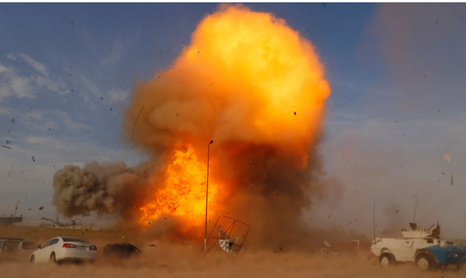
SCENES FROM A COUNTRY DIVIDED: (Clockwise from above) A car bomb attack at a Shi'ite political rally in Baghdad in April; Iraqi security forces arrest suspected Islamic State militants in Hawija in April; Iraqi security forces clash with Islamic State militants in Babel, also in April. On the cover: The aftermath of a car bomb attack in Baghdad's Sadr City district in August.