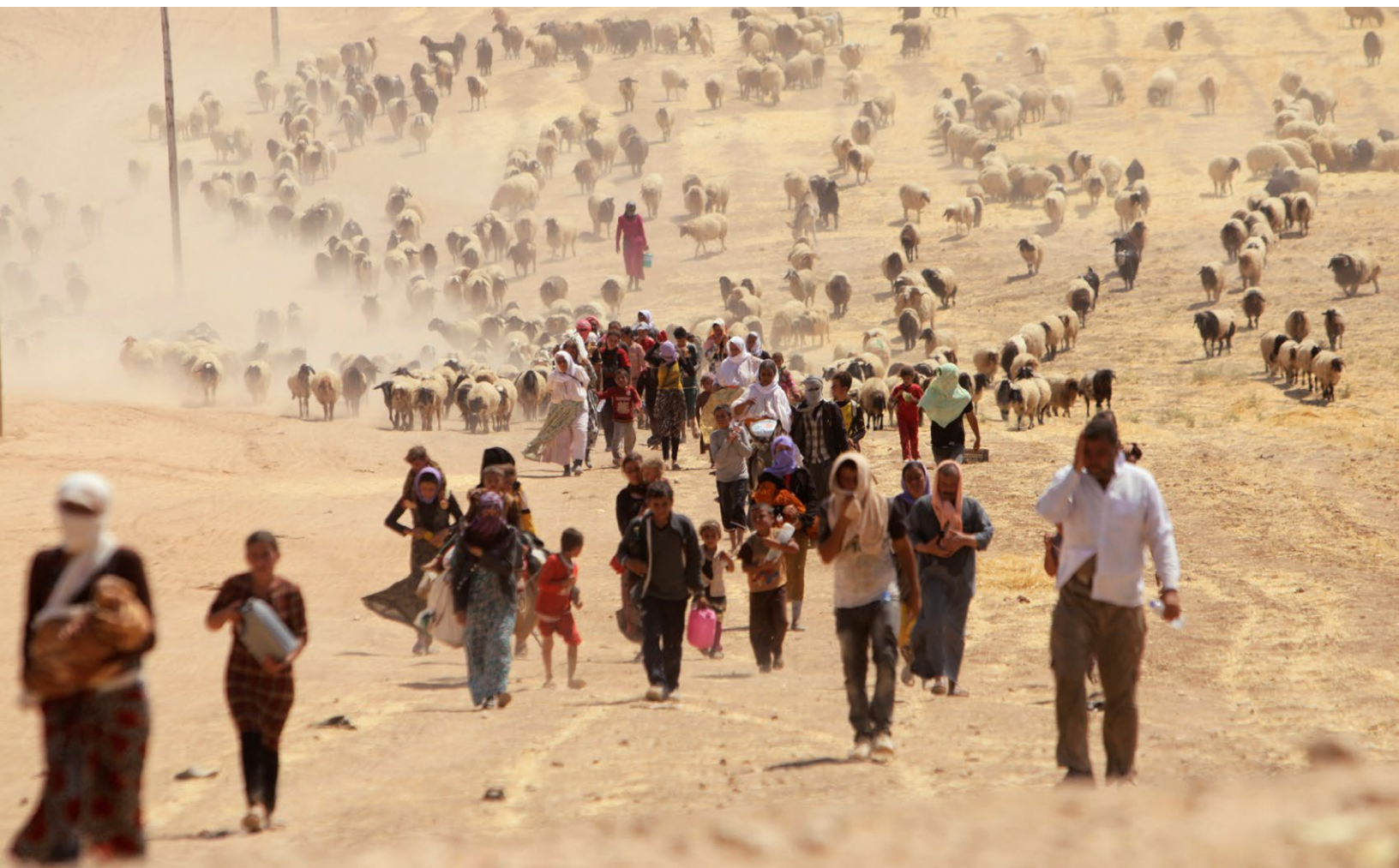
EXODUS: (Clockwise from above) Displaced people from the minority Yazidi sect flee Islamic State forces in Sinjar in August; A Kurdish Peshmerga fighter keeps guard in Gwar in September; Displaced Iraqis arrive in Sulaimaniya in August.