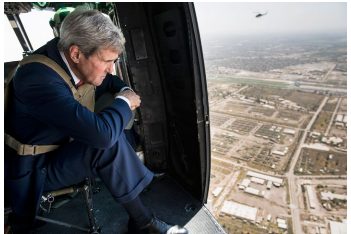
FROM ABOVE: U.S. Secretary of State John Kerry flies over Baghdad in September. Washington has given military, political and financial support to Iraq to defeat Islamic State militants.

The sheikh, though, does not believe he can rely on Iran altogether. He is sure some Iranian-backed