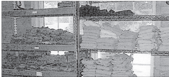
The Bay County Sheriff’s Office took these evidence photos of Heritage Boys Academy. They show, at left, a laundry area in which bloody underwear was found by deputies; at top right, Confederate bumper stickers — and one that reads “Spank your child! Or they may grow up to be a Democrat” — on a trailer on the school’s property; and a supply room with shelves stacked with military-style clothing.